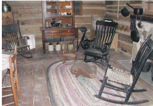
This looks like a shot of the Parlor.