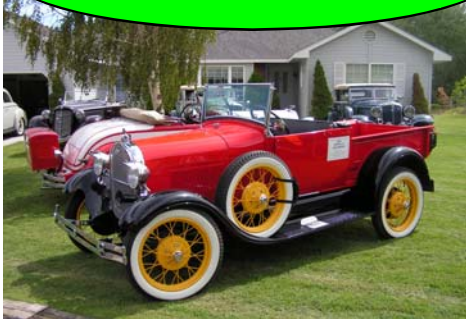
This little beauty belongs to a new member,

Official newsletter of Ye Olde Car Club of Tri Cities Inc