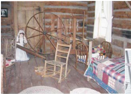
This could be a bed room.