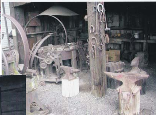
Above is probably the shop.